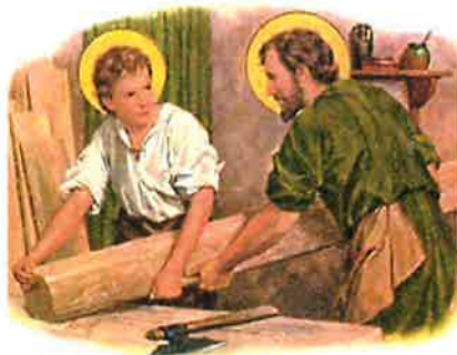
St. Joseph the Worker

How is this “journeying together” happening Today in our Church? How has God accompanied you in your life? What role has the Church and Parish played? Do you feel welcome? What steps does the Spirit invite us to take in order to grow in our “journeying together”? What does it mean to participate? Who is left on the margins? What is the mission of the parish today?